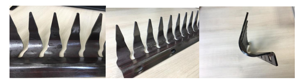
Figure 2: Comb with tangential channel

The sequence of experiments was following: preliminary setting up and preparation of the device for carrying out the experiment. For this purpose a cowling together with a serial rotor was removed and the modernized sample of the rotor was installed. It was equipped with combs with the tangential channel (Figure 2).